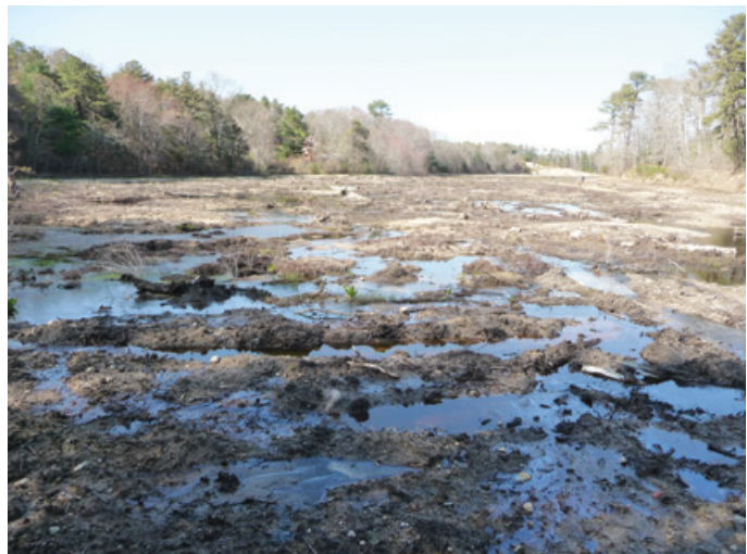
The site graded after sand was removed, ditches were filled, and sediment was moved (2010).