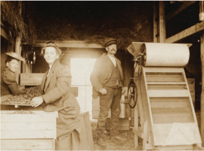
A screening machine separated spoiled cranberries from good ones through a bouncing process. Skilled workers were still required to handpick cranberries before being shipped.