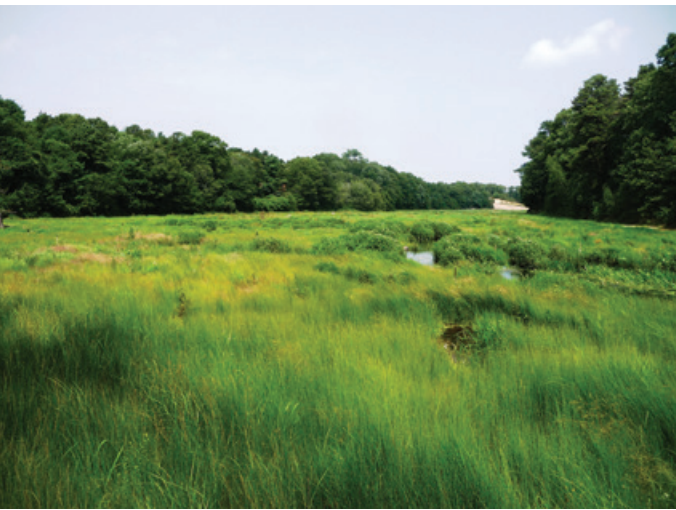
Four months after construction began, plant growth can be seen along a reconstructed stream channel. (2010)