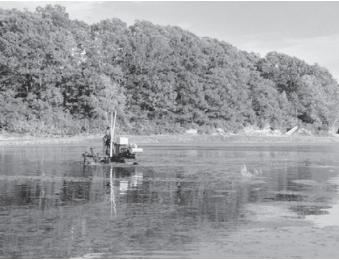
Circa 1960 - Motor-driven picking machines were introduced after World War II to help with wet harvesting of cranberries.