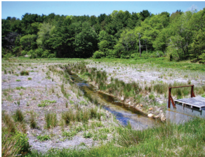
Photos of the cranberry bogs in 2008 prior to the start of construction on the Eel River Headwaters Project.