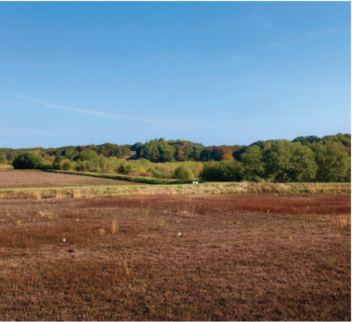
The Marstons Mills bogs today.

BCWC is excited about our partnership with the Hamblins and our numerous projects on the bogs, from bioreactors that filter out nutrients and impurities before they reach great waterways, to restoring these bogs back to natural wetlands.